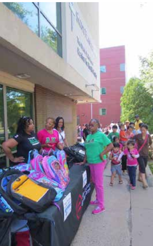
2015 First Day the Right Way Backpack Giveaway

From 990 and audited financial statements for the fiscal year ended June 30, 2015 issued by our auditors Whittlesey & Hadley, PC are available by contacting the Urban League of Greater Hartford at 860-527-0147